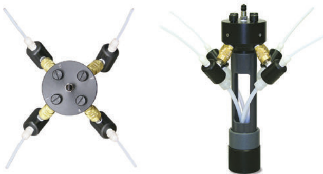
Top and Side View of Multi-Purge Manifold with 4 Pumps Connected.

®Teflon is a registered trademark of DuPont Corp.