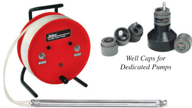
Portable Pump on Hand Reel

For less frequent sampling, reel mounted portable systems allow access to multiple monitoring wells, even in remote locations. The reel mounted portable units are free-standing with a convenient carrying handle. They can be made for almost any size or depth of application.