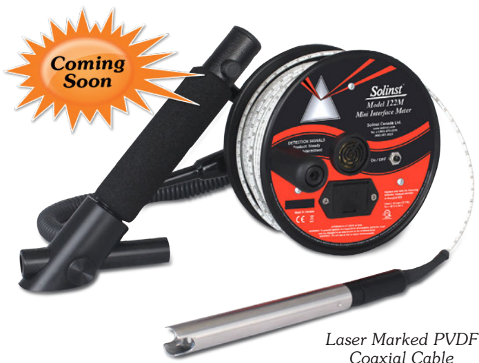
Laser Marked PVDF Coaxial Cable