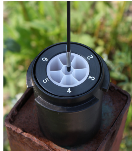
Measure Water Levels within the narrow channels of a Solinst CMT® System.

The 102M Mini Water Level Meter is available in 80 ft. and 25 m lengths. There is the choice of the P4 or P10 Probe.