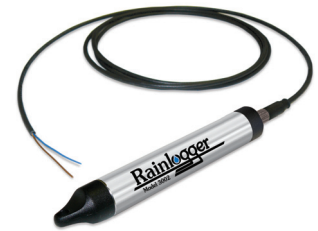
Rainlogger with 3-Pin Connector Cable