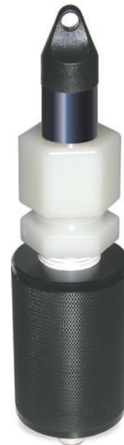
NPT Adaptor with Levelogger Installed

®Solinst is a registered trademark of Solinst Canada Ltd.